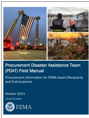
PDAT Field Manual

This in-depth resource lists, describes, and exemplifies the mandatory requirements for recipients and subrecipients when purchasing under a FEMA award. This manual supersedes the 2014 , 2016 , and 2019 versions of the FieldManual.