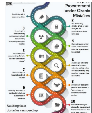
Top 10 Mistakes when Purchasing Under a FEMA Award

This contract provisions guide helps recipients and subrecipients understand which clauses are required for their contract and includes sample language for those clauses. This guide supersedes the 2019 version of the contract provisions template, in Spanish .