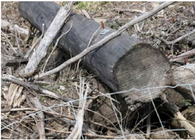
Steel bolts lock the log frames together providing stability and strength to the structure.

“Whittler’s goal is to close the canopy within three years,” Meyer commented. “To close the canopy you have to have your spacing very close together, but once the sunlight is taken out from the ground, nothing else can grow. The key is to go in there, maximize the native species, and wipe out the nonnative species. Give those native species time to get up and close the canopy.”