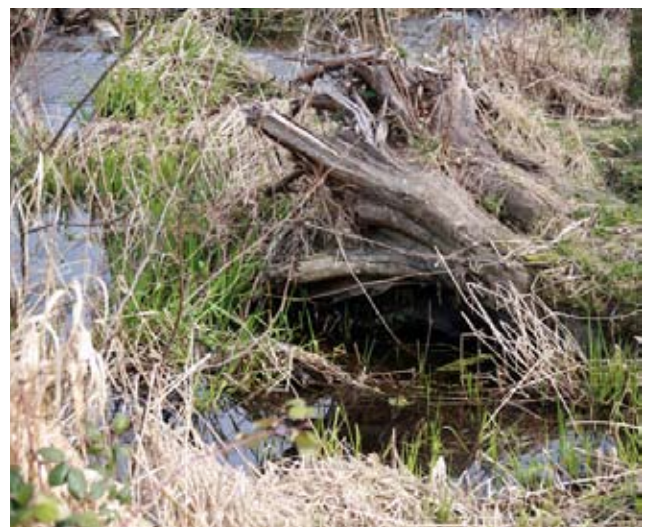
Many of the logs are actually buried in the banks.