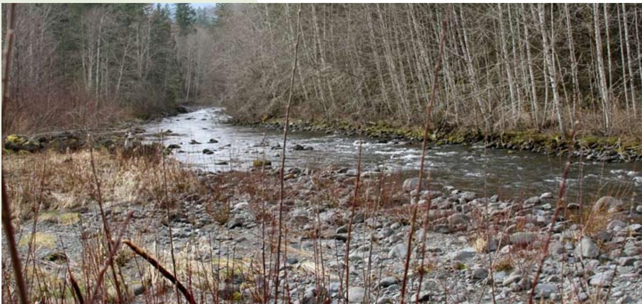
Planted willows, dogwoods, conifers and other trees will create a mat of roots to help stabilize the riverbank.

The first step in installing the groins involved temporarily blocking the river from entering the construction site. Since the project was undertaken while the river was at a seasonally reduced level, only a small area had to be coffered off with sandbags. Once the construction site was secured, three trenches extending 25 feet back into the bank were dug, and tapered down into the river channel. Multi-sized rocks similar to that used in riprap design were then carefully layered into the trenches.