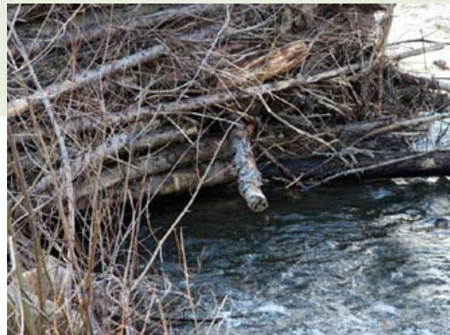
The pools established behind each jam provide much needed habitat and refuge for migrating fish.