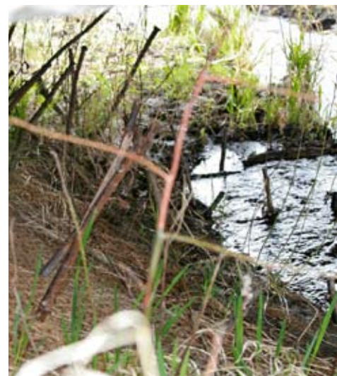
Coir matting and planted vegetation stabilize the creek banks under the bridge.