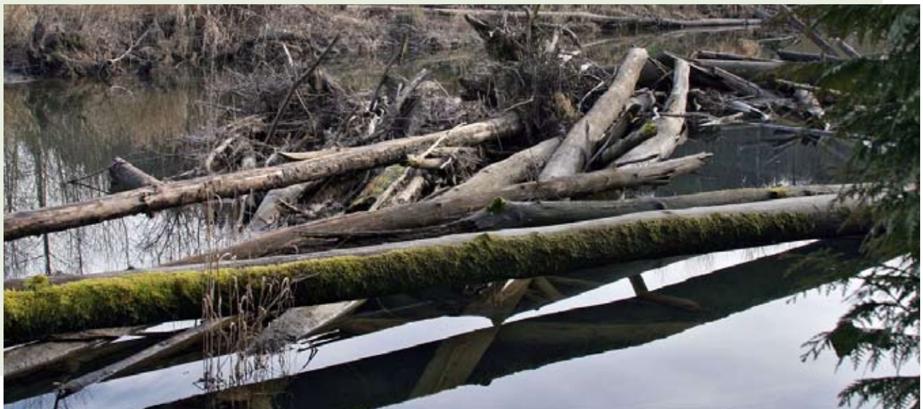
During flooding additional woody debris is recruited by the original logs.

In 1990, the Middle Green River created a whole new quarter mile meander bend in just over one day. In the process, the river demolished 150 feet of rock lined levee, a dozen maple trees and a couple acres of the Hamakami Strawberry farm. Historically on the Green River, rock riprap was used to prevent embankment scour. On such an alluvial floodplain as the Hamakami property, with an abundance of silt and sand, however, slumping is the primary cause of bank failure. Fine grained materials do not provide bank resistance, so in a high energy event, like the one that occurred at the Hamakami site in 1990, the Green River was able to move laterally at a very rapid pace.