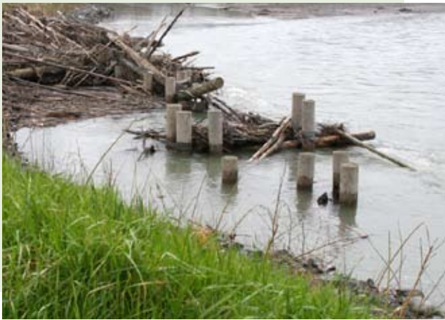
One of the scour holes being stabilized by the Overflow project. Woody debris has begun to collect and will be incorporated into the riverbank.

The Everson Overflow, located outside the town of Everson in Whatcom County, Washington, has wide-reaching affects during high water events. The overflow is a high ground divide situated between the Nooksack River Basin and the Fraser River Basin. During significant flood events at this site, water tends to overtop the right bank of the Nooksack River and spill into the Everson Overflow. It can then surge into the Johnson Creek floodplain, flowing north, and ultimately reaching the Fraser River Basin in British Columbia, Canada. In the aftermath of one such occurrence in 1990, the Trans-Canada highway was closed for several days and millions of dollars of damage occurred. To address this trans-boundary flooding issue, an international taskforce assembled consisting of a number of agencies and technical experts from both Canada and the U.S.