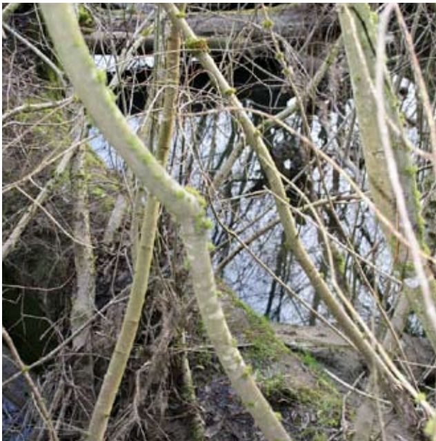
Recruited vegetation lends cohesion to the riverbanks.

The 1990 flood event left a steep 10 to 15-foot high raw embankment along the Hamakami Strawberry Farm. As a result, over the following years, the farm lost a significant amount of land to the river meander that was moving rapidly through the property. In fact, strawberries from the farm were literally falling into the river channel.