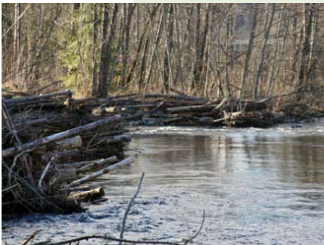
The complexity added by the logjams is important for slowing down water flow on the river.

“We needed to figure out what we could do to help fix the riverbank and change the flow characteristics of the river without accelerating flow through the reach.” - Ian Mostrenko