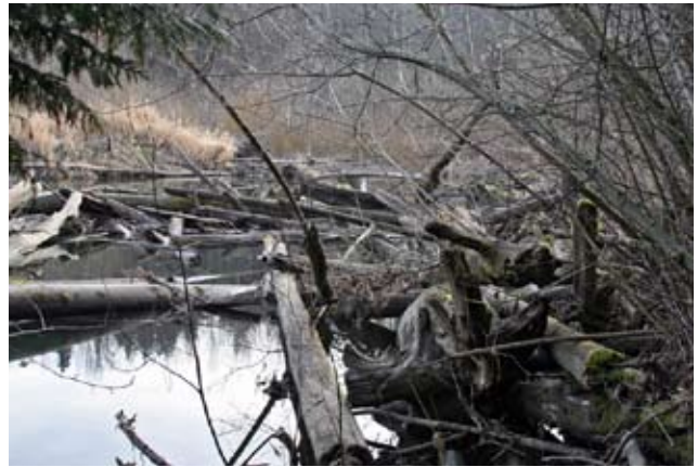
Numerous logs are placed along the toe of the riverbank.

"We wanted to see how wood could be used constructively without destabilizing banks." - Andy Levesque