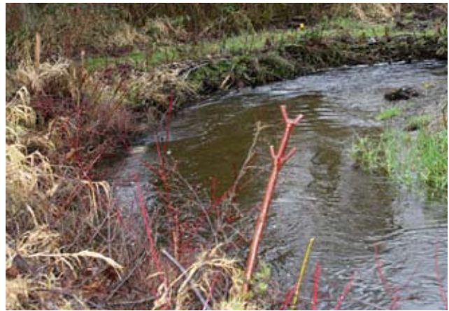
The added vegetation to the creek provides habitat and cover for fish.

"The reason that we are allowed to do this work is that Washington State Fish and Wildlife considers it an enhancement to the stream," said Geiger. "It simulates a heavily vegetated stream bank. Fish just love it. We've actually seen fish using it as we are installing it. They get right in there and use it for cover and so forth. It was pretty surprising."