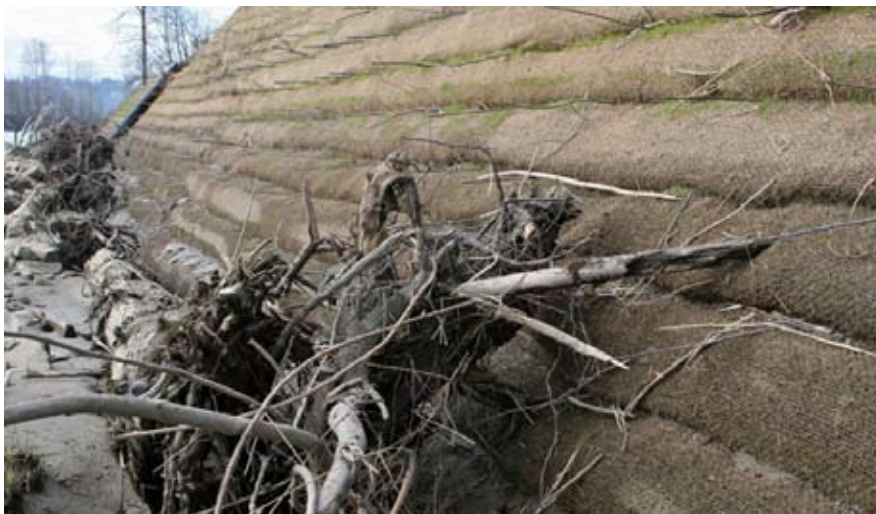
The offsetting of the soil wraps comprising the structural earth wall (SEW) give it its step-like appearance. The logs anchored to the toe of the embankment protect the structure from fast flowing woody debris and provide habitat for migrating fish during high water.

Since the embankment along Riverview Road is so steep, typical stabilization techniques were impractical. Jones and his team of Snohomish County Road Maintenance workers built a structural earth wall (SEW) composed of a number of soil wraps placed in a step-like fashion starting from the waterline and climbing to the top of the embankment. Each step is created by laying down a 13-foot wide roll of polypropylene or polyethylene geo-grid fabric. The grids are