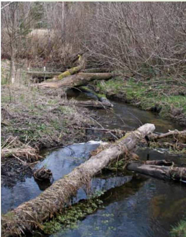
The entire area is protected as an ecological preserve.