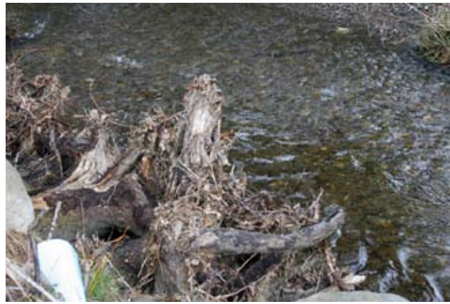
The logjams are extended into the water providing needed roughness.

The second portion of the project involved the introduction of rock cobbling to the lower portion of the creek on the Bridges' property, which was intended to reduce the velocity of the water, while covering the