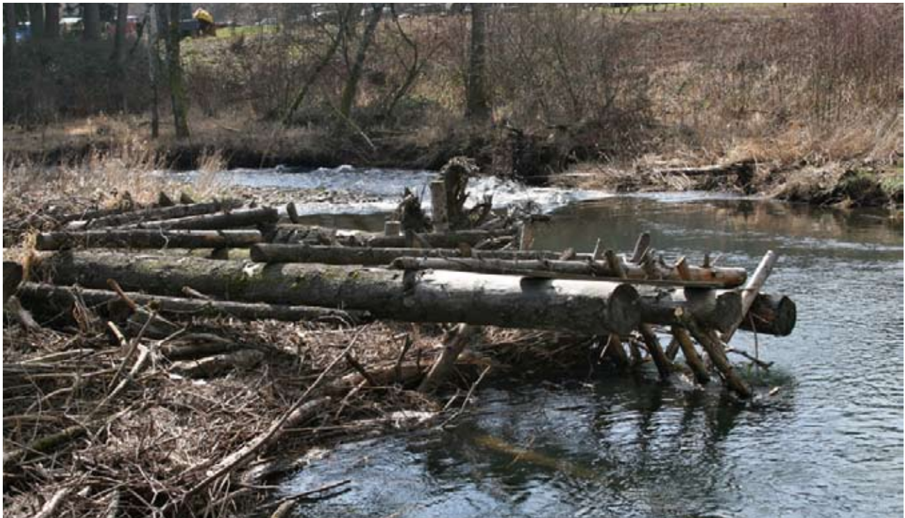
The porous design of the debris catcher allows fish to swim through the structure unimpeded.