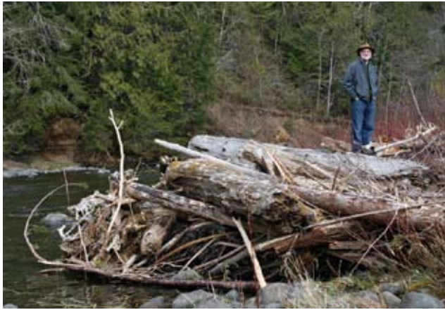
Al Latham stands on top of one the groins extended into the river.

The National Forest Service donated almost forty 25 to 30-foot long logs, several with root wads still attached, which the Forest Service retrieved from areas of blow-down during previous storms. The logs were laid within the trenches, several logs to a trench, with the root wads sticking out into the river. To lock the structures in place, the logs were integrated with the rocks. Additional rocks were then piled on top of the logs, giving the structures strength and stability.