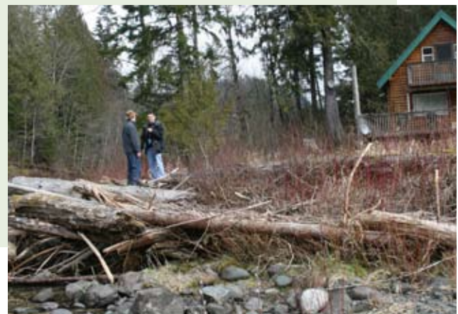
In the background stands one of the Hiddendale properties protected by the project.

“The typical approach before we did this would have been to line the banks with riprap, using the same size material we used in the groins,” said Latham. “The thing is, when you go that way, currents accelerate along riprap, and you’re just sending the problem downstream. You don’t get any improved habitat or channel diversity. It’s just a rock wall. With these three small groins, it didn’t establish a big footprint, but it’s really kept the thalweg, or the main part of the river, well out beyond the bank, preventing any further erosion. It also created all this habitat in between each groin. Now the bank has been stabilized as well or better than riprap ever could do it.”