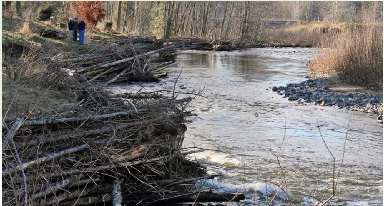
Four of the engineered logjams designed by Herrera Environmental Consultants on the Mashel River outside of Eatonville, WA.

On the Mashel River, just outside of the town of Eatonville, Washington, Smallwood Park contains a pond utilized by the town's residents for their annual fishing derby. Every few years the Mashel River is subject to flooding and the park, along with the pond, becomes inundated with floodwaters. The river embankment by this pond has begun to erode, and with each new flood event, the park, and the County road nearby, are potentially threatened with damage.