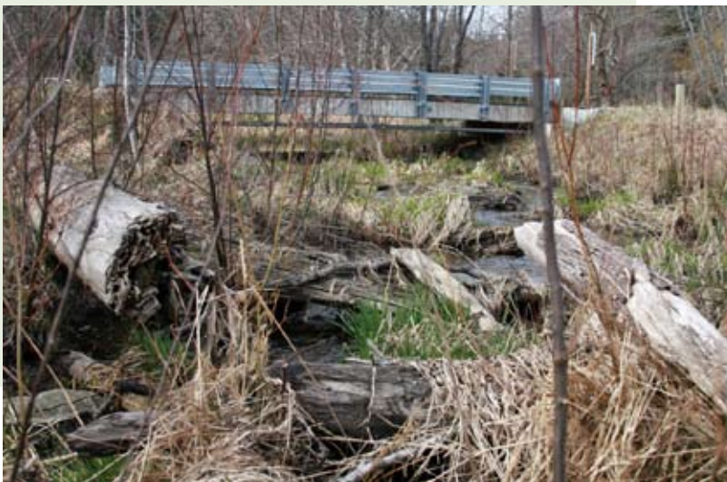
Wood positioned downstream of the bridge slows water flow and provides habitat for fish and other wildlife.

“When a large amount of water goes through a culvert, it acts as a fire hose, and it can cause a lot of impacts further downstream as well.” -Peter Bahls