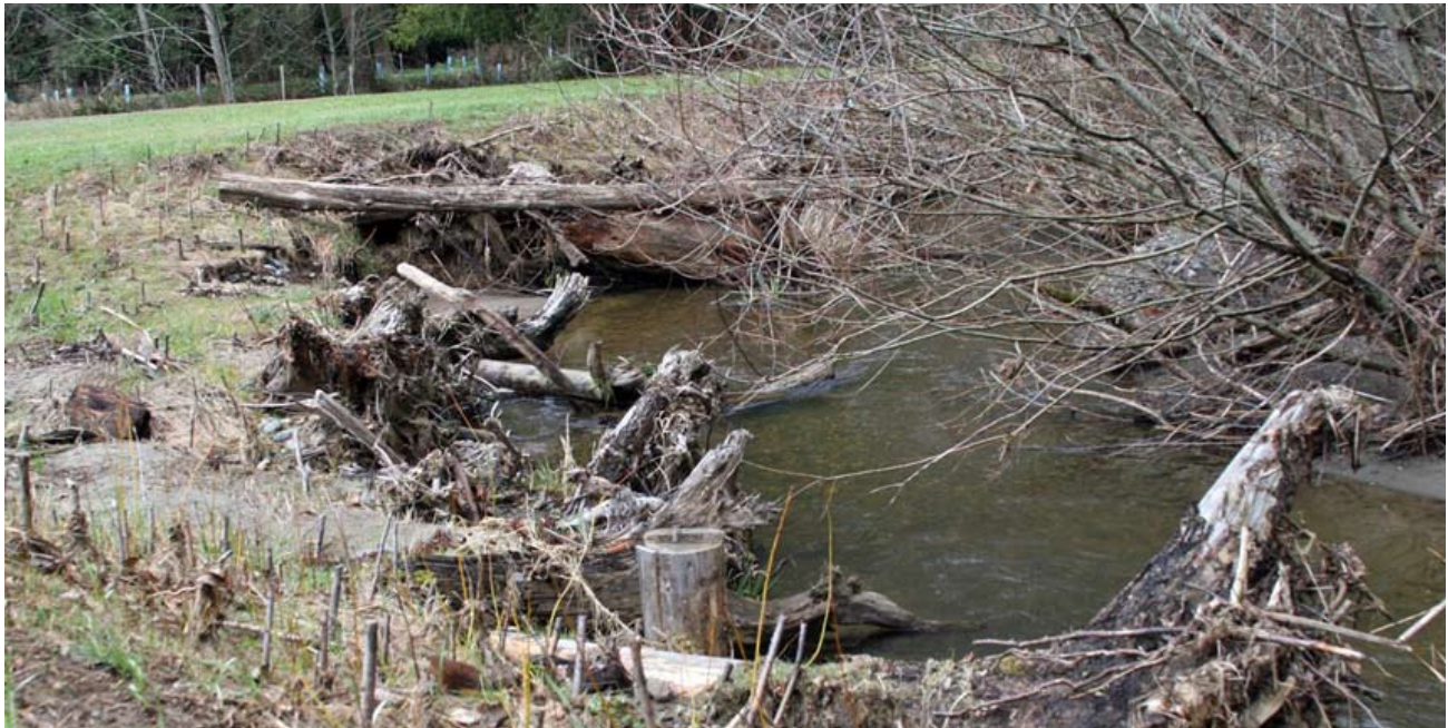
Wood added to the banks of Schneider Creek slows water flow and improves habitat diversity.