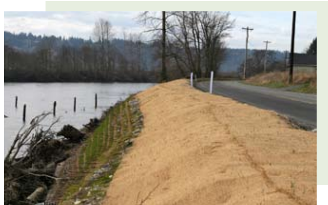
Eventually the coir fabric and the structural earth wall itself will be completely overgrown with hydro-seeded grass and other vegetation.

“Overall, this type of design will require less ongoing maintenance than riprap,” said Lucas. “It secures the riverbank against erosion, and it helps to meet our commitment towards maintaining salmon habitat, a stated goal of Snohomish County. When we can add those elements together and stabilize a County road in a habitat friendly manner, I think the project speaks for itself.”