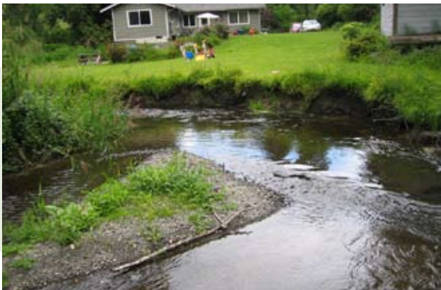
The eroding property prior to the start of the project.

"It was during a period when the Fish and Wildlife Department would normally not allow you to do any kind of work in this stream," said Geiger. "However, these types of structures can be installed with just about zero sedimentation. This qualified us for the streamlined Hydraulic Project Approval, which takes a much shorter time to permit, and eliminates the