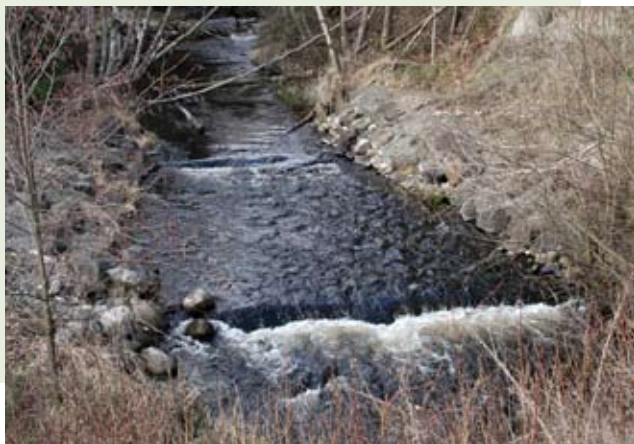
The restructured channel is now far easier for fish to traverse during migration.