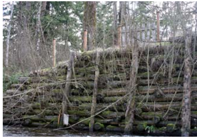
The crib wall will overgrow with vegetation, which will ultimately become the structure itself when the logs finally decay.

sun exposure. It took a lot longer to establish than the section that was shaded by the big trees and not facing direct sunlight. That section had perfect establishment straight away."