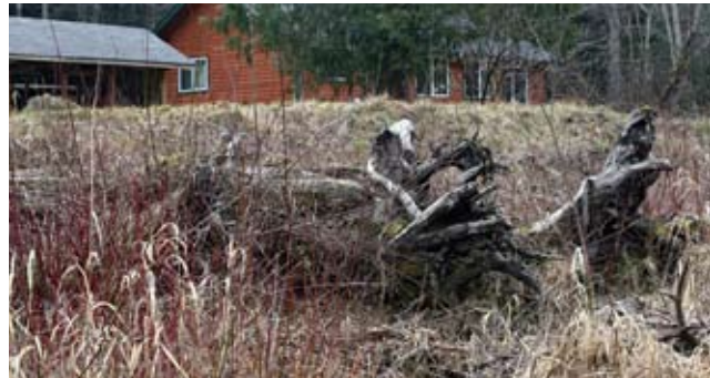
Downed trees claimed by the Forest Service provide the skeleton for the rock groin structure.

“The first step was to pull the dike back about 40 feet and make a little more room for the river to occupy,” said Al Latham, District Manager for the Jefferson County Conservation District. “They then installed three rock groins into the river along a 200-foot section of the Hiddendale riverbank, the outer edges of which were approximately at the edge of the prior levee’s location. Then the entire area was heavily planted with willows and other vegetation.”