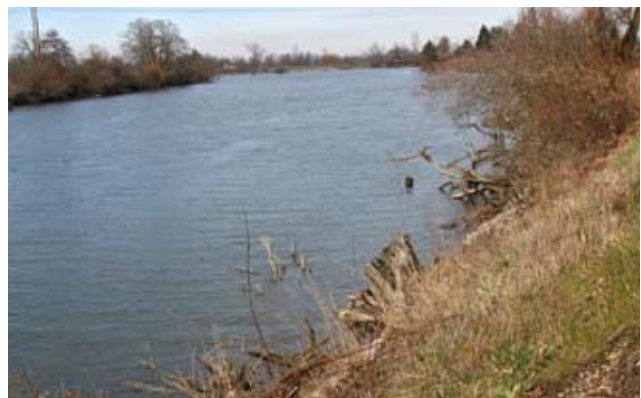
The completed project, a short distance down the road, is now fully vegetated and looks entirely natural.