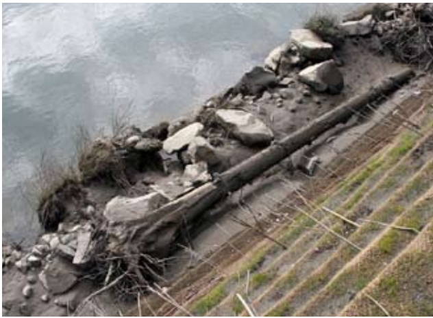
The willow cuttings planted throughout the embankment lend root cohesion and stability to the structural earth wall.

weighted down by layers of compacted gravel-borrow taken from a local quarry. The geo-grid is folded over, and another layer of gravel is used to weigh it down further. As each wrap is completed, the following one is offset by at least one foot, creating the step-like design. The outer face of the wall is covered with a layer of heavy coir fabric, and topsoil which is then hydro-seeded. This allows the geo-grid to lock in place and secure the embankment without threat of degradation from exposure to ultraviolet light. Finally, the entire embankment is planted with live willow cuttings which ultimately take root. As the trees grow, their root structures add to the stability of the embankment.