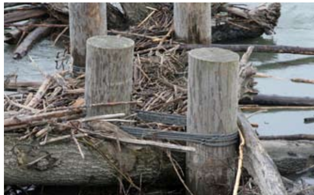
The timber piling structures capture woody debris, which provides roughness to the river, and ultimately establishes additional habitat.

“The lower main stem Nooksack is an important river for a number of species,” said James Lee. “It is a migratory reach for Chinook and coho salmon, as well as steelhead trout. Bull trout, which are listed under the