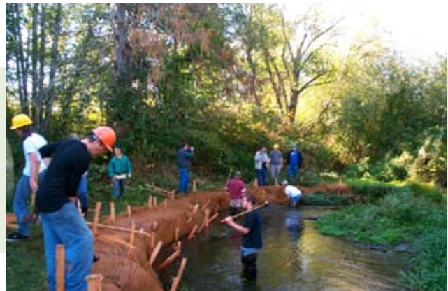
Construction of the brush mattress underway.