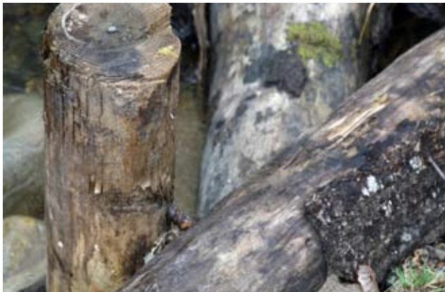
The logs in the jams are secured to each other with rebar.

“The whole site is a lot more ecologically functional for fish and wildlife habitat now, not to mention the banks being protected” said Kuttel. “When you use plant materials, it actually slows the water down. When you armor a bank, it is protected from erosion, but the energy is often redirected to the opposite bank downstream, causing damage to someone else’s property. Then the next landowner has to do it, and then the next, just to protect their property. When you use something like willow cuttings, the water just lays them down and the energy is dissipated instead of tearing the banks all apart.”