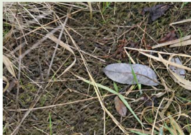
Coir fabric covers the upper bank.

Along the linear portions of the embankment, the county laid large limestone rock up to the ordinary high water mark. Seventy-five pieces of large woody debris were then placed along the project length with