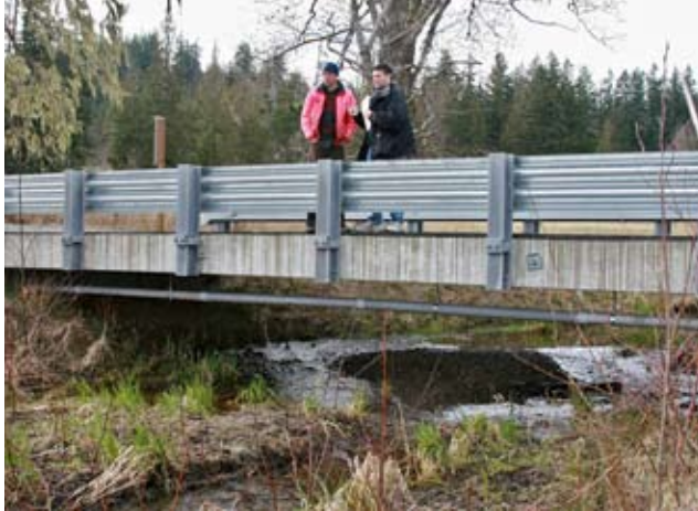
The extra wide design of the bridge ensures adequate room for water flow during flood conditions.

The bridge was installed with the use of concrete pilings driven approximately 20 feet into the ground, removing the threat of instability due to possible undercutting. Though the channel width was only 13 feet at its maximum, they designed the bridge to span over 40 feet in length.