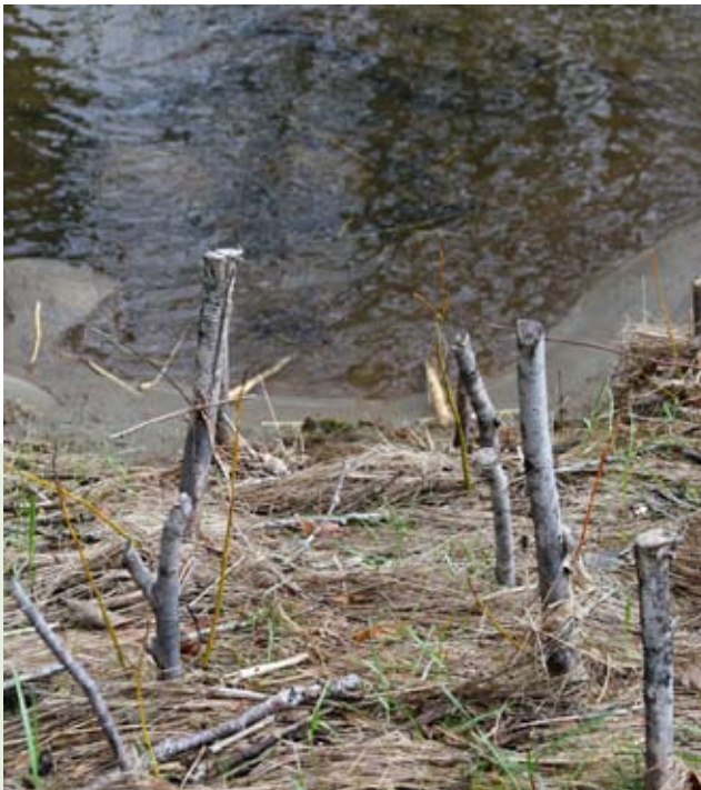
The entire bank is covered with willow cuttings for root strength.

Though it takes years for the plantings to grow, the designers prefer to use smaller willow cuttings, approximately 24-inches in height, to start. Once the