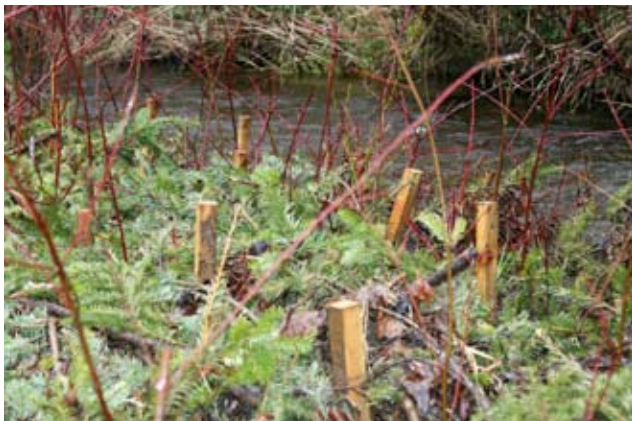
Cedar stakes driven into the creek bank provide additional soil retention.

In sensitive ecosystems, when emergency management is needed for stream bank erosion control, brush mattresses can inhibit erosion without threatening habitat and requiring costly mitigation measures at a later time. Installing the brush mattress does not significantly disturb fish spawning habitat and once installed, the structure provides complex habitat for fish and other aquatic species.