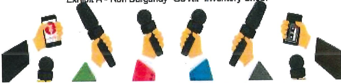
Exhibit A - Ron Burgundy "Go Kit" Inventory Sheet